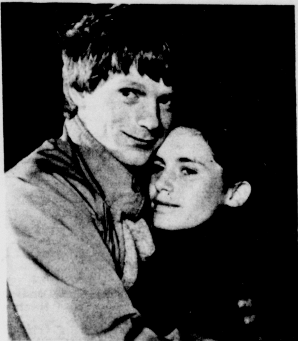
Dean Butler and Stephanie Zimbalist portray teen-agers who make a commitment to love one another far too soon in their lives, in "Forever" Friday at 8 p.m. on channels 2 and 6.

Stephanie Zimbalist and Dean Butler star in "Forever," a two-hour television movie to be broadcast on "The CHS Friday Night Movies," Friday, 8-10 p.m. on Channels 2 and 6. The romantic drama is the story of a teen-age girl's first love, her pledge to her young man that it will last forever, and her painful awakening that this commitment cannot last.