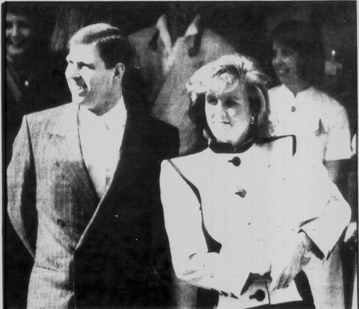
The Duchess of York holds her new daughter, Princess Eugenie Victoria Helena as Prince Andrew beams upon leaving Portland Hospital in London.

"But because we were in the public eye, it was all extremely distorted. That's when I really started to develop a deep hatred for a certain part of this business."